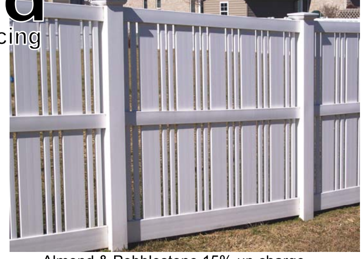
Almond & Pebblestone 15% up charge. Clay 25% up charge.