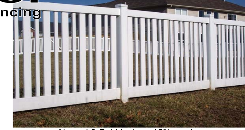
Almond & Pebblestone 15% up charge. Clay 25% up charge.